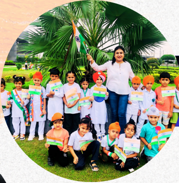
Tricolour Dress Up Day