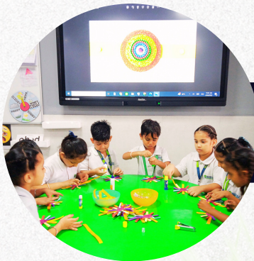
Rakhi Making Activity