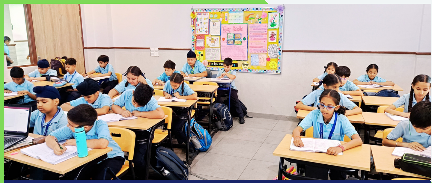
"The art of calligraphy lies not only in the elegance of the strokes but also in the beauty of self-expression."